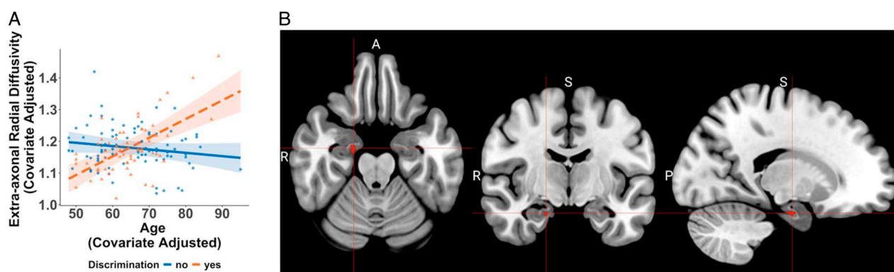
FIGURE 3. Associations of hippocampal microstructure metrics and age by major lifetime discrimination group status. A, Scatter plot visualizing the moderating influence of major lifetime discrimination group status on the voxel-wise relationships between age and extra-axonal radial diffusivity in the bilateral hippocampal mask, adjusting for sex, race, and educational attainment. Data points are color-coded and represented as triangles for those who experienced discrimination, and circles for those who did not. Each data point represents the mean of all significant voxels for one individual. B, Representative brain slices show voxels with significant relationships (at \alpha < 0.05 , family-wise error corrected). Color image is available only in online version.

(having experienced at least one severe discriminatory event such as being denied a job, a promotion, or a loan due to discrimination) showed steeper relationships between age and microstructural health consistent with accelerated brain aging. These effects were observed across widespread regions of whole-brain white matter and in the hippocampus. Older age is a powerful predictor of adverse brain microstructural changes. However, major lifetime discrimination experience amplified (exacerbated) relationships between age and complementary diffusion parameters from both statistical and biophysical diffusion models in white matter and the hippocampus.